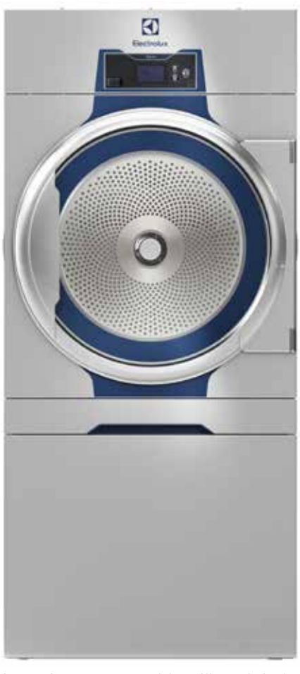
Images shown are a representation of the product only and variations may occur.

To get the door design you need to add the insulated glass.